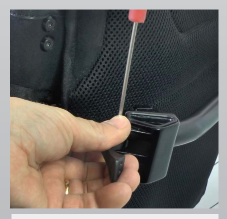
5) Tighten the screw and make sure that the nut slides into the attachmnet properly.