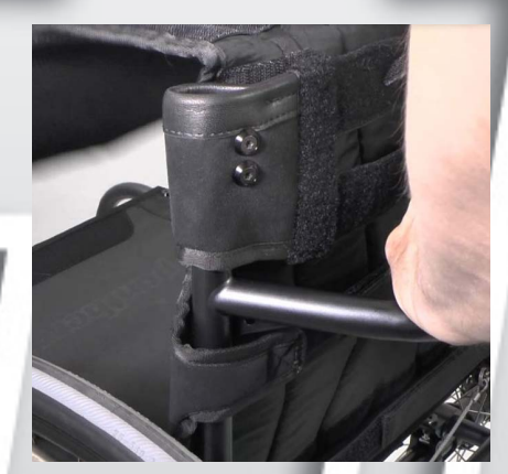
1) Open up the backrest upholstery to get easy access.