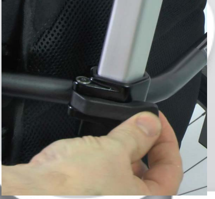
1) If the locking of the push handle is insufficient. you can adjust this according to the following instructions..