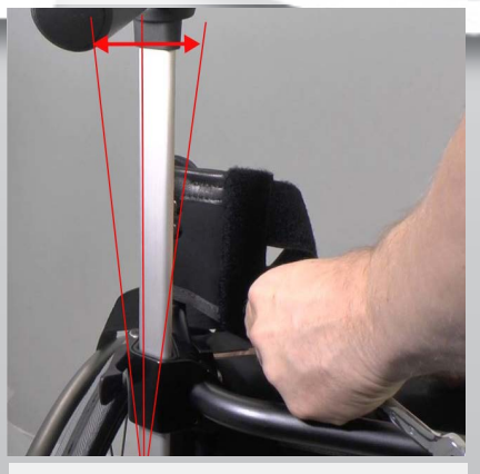
5) If the angle of the push handle needs to be adjusted, you can turn the excentric metal cup with a 10 mm spanner.. Start with loosen the screw that holds the attachment, a bit.