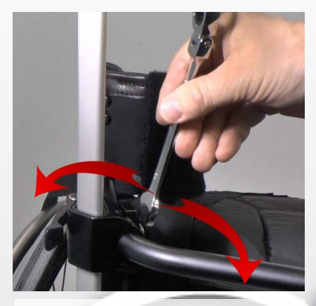
6) Use a 10 mm spanner and turn the metal cup forwards or backwrads until the oush handle is vertical.