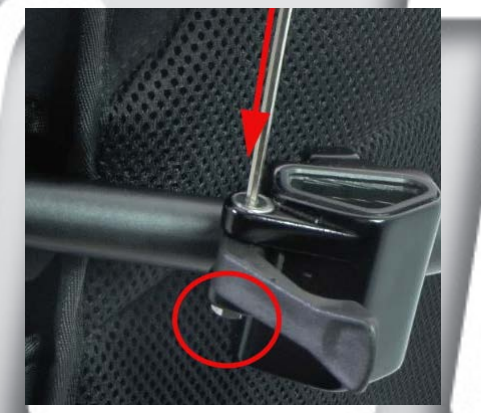
3) Push the screw downwards until the nut on the underside gets visible

2) Disassemble the push handle. Loose this screw a few turns with allen key 2.5 mm.