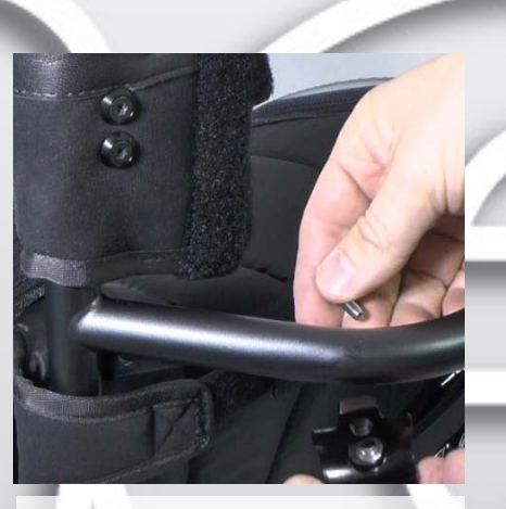
3) Open up the attachment and place it around the backrest tube, and let the metal cup guide the attachment onto the knob at the backside of the tube. Fold the attachment and mount the M5 screw.