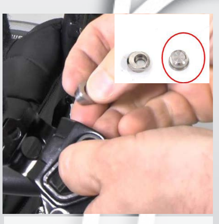
2) Bring out an attachment, there is a left and a right version, place the "closed" metal cup into big hole in the attachment, from the inside.