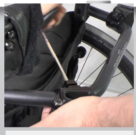
4) Tighten the screw with allen key 4 mm. Repeat the procedure on the right side.