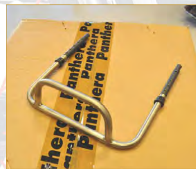
Foot rest 1p or footplates 2p