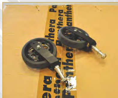
Castor wheels 2p