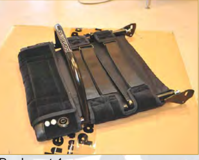
Back rest 1p