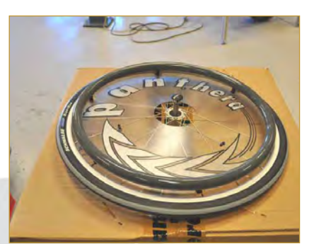
Rear wheels 2p