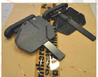
Side guards 2p or without sideguards