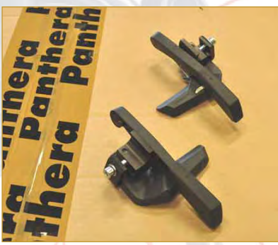
Brakes 2p or one hand brake 1p