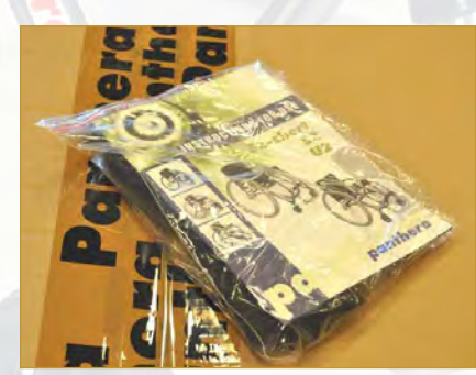
Manual and tool kit 1p

Panthera AB, Gunnebogatan 26, SE-163 53 Spånga, Sweden, +46-8-761 50 40, www.panthera.se