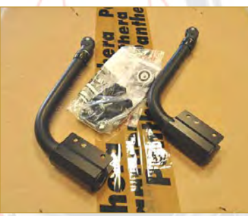
Anti-tip 2p or without anti-tip