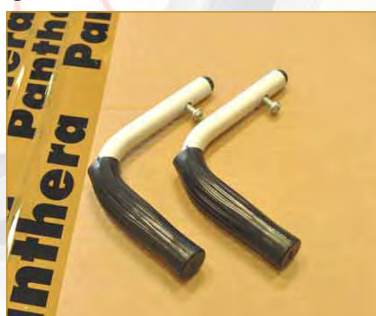
Push handles 2p or without push handles