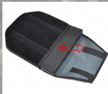
3) Pull out the cushion with cover.