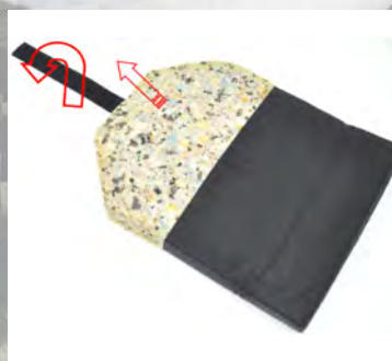
4) Loosen the strap attached with velcro and pull the cushion out of the cover.