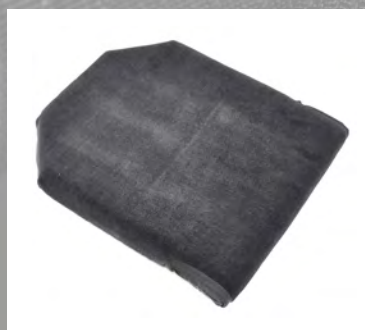
1) The cushion seen from top.

Sometimes you need to adapt the cushion to the seat depth of the wheelchair for Bambino and Micro. Follow these steps below.