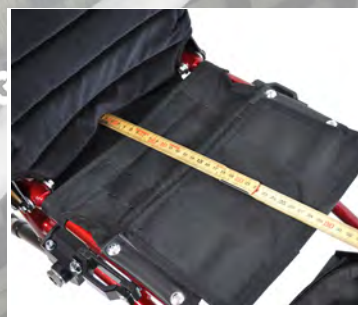
5) Measure the seat depth of the wheelchair.