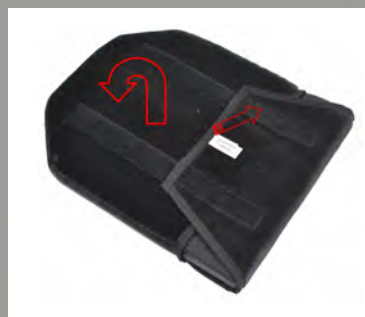
2) Turn the cushion up side down and open the flap, attached with velcro.