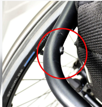
Upgraded backrest with threaded knob