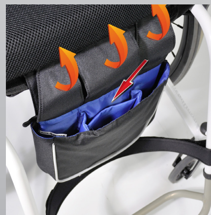
If you lift the three flaps locked with magnets you find more storage for e.g. cellphone, wallet