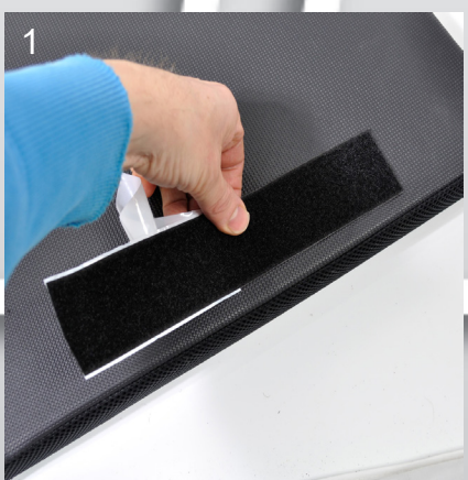
Mounting of the enclosed velcro tape to the underside of the cushion on cushion mounted bag. (This stage is no longer necessary when the S3 cushion now has a premounted velcro) Attache the cushion mounted bag's velcro to this tape.