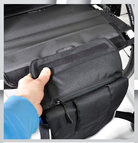
Mounting of seat mounted bag to the velcro of

The seat bag's loose end is attached to the chassis tubes with magnets.